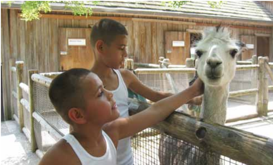
Two brothers visit Brooklyn's Prospect Park Zoo.

In September The U. S. Department of Housing and Urban Development (HUD) selected Housing + Solutions as the substitute grantee to take over a homeless project in Brooklyn serving up to twenty homeless women with substance abuse disabilities. The city-wide competition to assume the contract gave us an opportunity to highlight our success and accomplishments: 77% of our tenants worked over the past year; 80% of the tenants are in recovery and no family has been separated. HUD and the New York City Department of Homeless Services consistently ranks us in the top 25% of the over 200 applications renewed annually. New staff members have been hired, we have a property and we have begun recruiting tenants. Our goals and theirs are: are housing stability, solving health and personal problems and self-sufficiency through employment. We look forward to the challenge of opening Ruby House and meeting the needs of formerly homeless women and families. The expansion will increase our housing capacity by 40% and we hope lead to new opportunities for public and private funding. Winter approaches and the need for shelter increases. Ruby House opens on December 1 and we will be ready to give women the help they need.