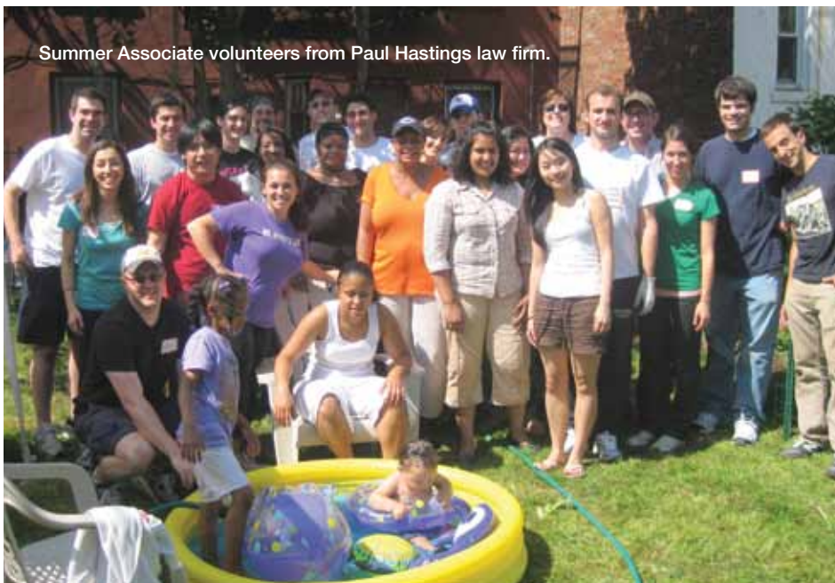
Summer Associate volunteers from Paul Hastings law firm.